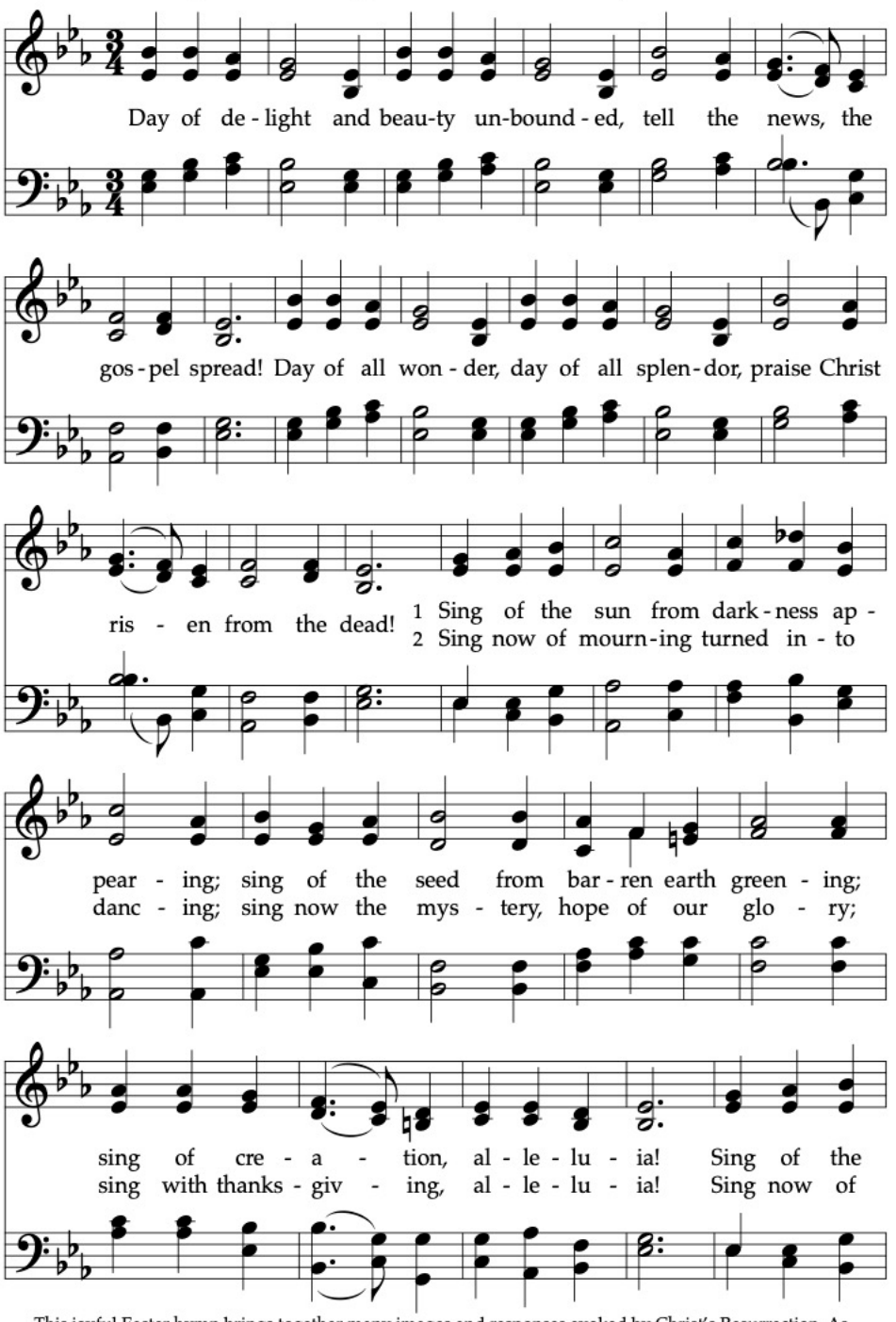
This joyful Easter hymn brings together many images and responses evoked by Christ's Resurrection. As the second stanza affirms, it does turn mourning into dancing (Psalm 30:11), for this 20th-century text was written to fit the rhythms of this 16th-century Italian dance-song.